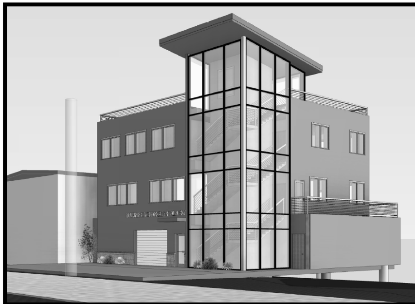
Figure 1: Illustration of proposed building consisting of ground floor parking garage and 2 nd & 3 rd story offices. Ground floor will be built up to both side property lines; upper stories will be 5' away from same side property lines.

VAR2014 022 is needed to reduce both side yard setbacks from 10 feet to 2 inches on the ground floor and 10 feet to 5 feet on the upper stories. See image below.