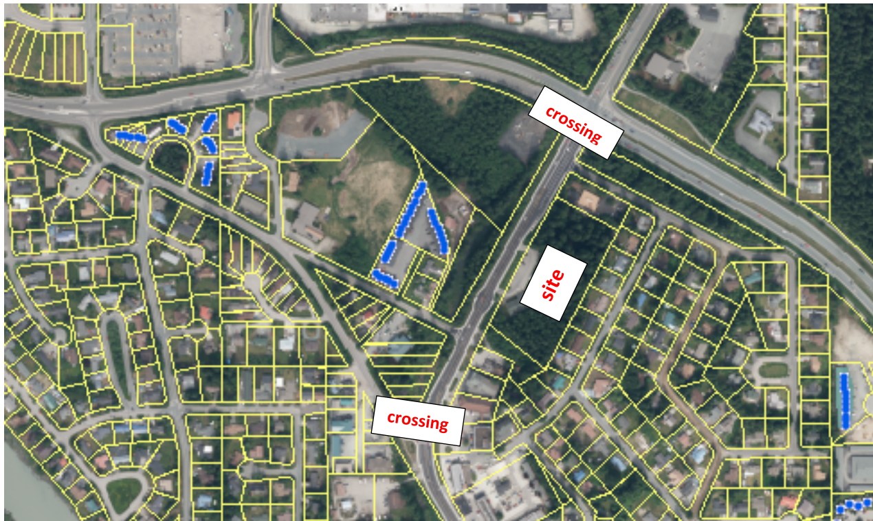
Figure 2: Aerial of site

Some infrastructure improvements must be considered to create a safe and accessible site. CBJ Public Works will install necessary lighting along the staging area. This will be an improvement from the Nugget Mall transfer station, which currently has no lighting along the staging area.