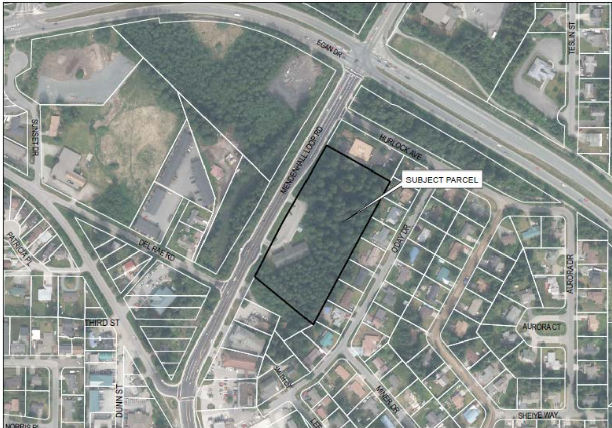
VICINITY MAP - CSP20140019