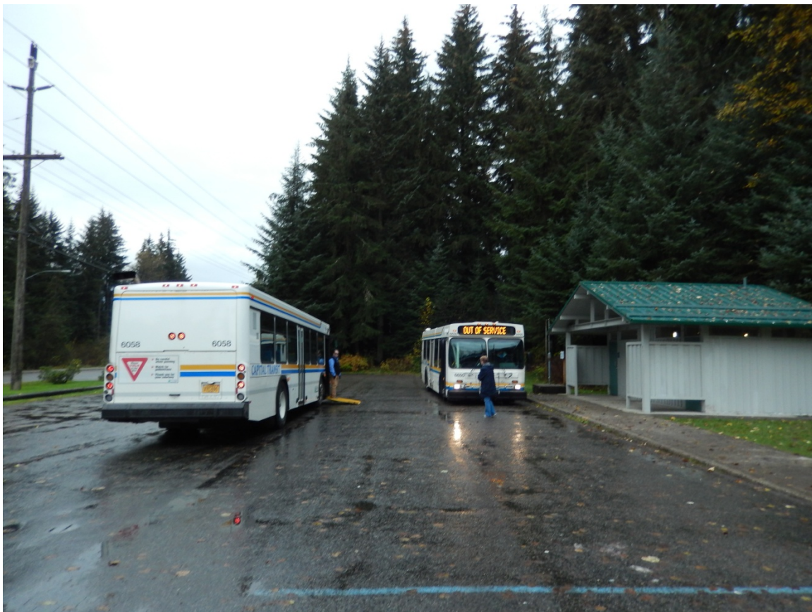
Figure 1: Proposed bus staging at Pipeline Skate Park

For riders entering or exiting the bus at this site, there are sidewalks on both sides of Mendenhall Loop Road. However, the nearest crossings are 620 feet to the north and 780 feet to the south (see Figure 2).