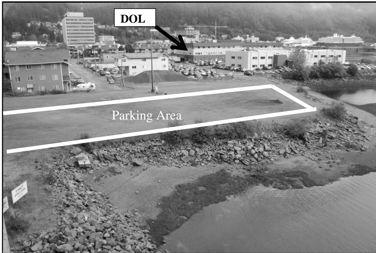
Figure 1: The proposed parking area is shown in the picture. The Juneau-Douglas Bridge is beyond the left side of the picture, the DOL building is in the background.

The applicant seeks to provide temporary parking at the Bridge Park (previous CBJ Public Works Facilities) for temporary staff parking at the nearby State Department of Labor building (DOL). See Figure 1.