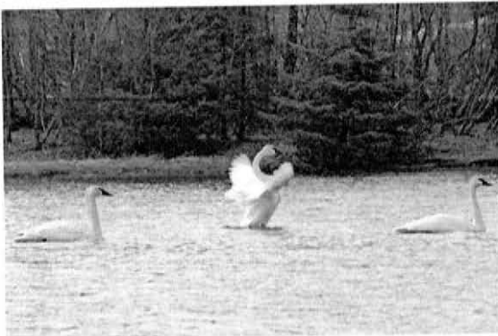
Figure 5. Trumpeter swans in pond.

In the pond, we observed up to seven Trumpeter swans Cygnus buccinators at a time (Figure 5), Canadian geese Branta Canadensis sp., mallards Anas platyrhynchos , mergansers Mergus sp., buffleheads Bucephala albeola and river otters Lutra canadensis . Threespine stickleback Gasterosteus aculeatus (Figure 6), sculpin Cottus sp., and crustaceans of the Order Amphipoda are year round pond inhabitants. Some areas in the pond have deposits of iron flocculate which is present in ground water in dissolved form.