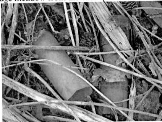
Figure 7. Shotgun casings.

Inside the berm we observed concrete slabs and other remnants of historical human use, including styrofoam floats pushed over the berm by storm surge and high tide. Shotgun cartridges are everywhere (Figure 7), though the private property is posted (Figure 8). We discovered a tidy camping spot on the east side of the pond where a spruce forested buffer separates the south sedge meadow from the east upland marsh transition area.