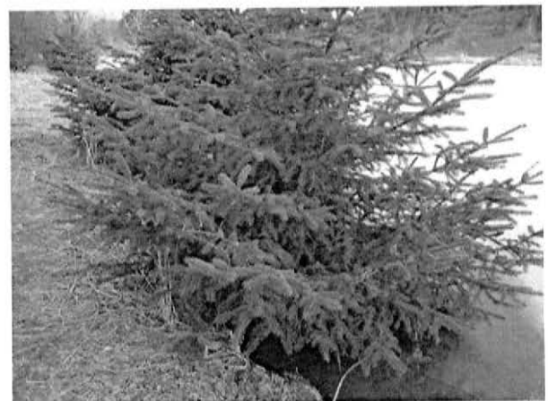
Figure 12. Spruce trunks rooted in pond margins.

An anadromous stream, No. 111-50-10625, flows around the southeast end of the pond berm (Figure 13). An ephemeral drainage trickles into the pond on the north side of the east forest berm. Rust staining on spruce suggests in addition to some ground water input, flashy flow from the upland marsh transition area and from the hillside drainage above Egan Drive and Glacier Highway enters the pond during storm events. There appears to be an ephemeral drainage through the east berm on the north side of the pond, south of the historical road entrance, though the drainage remained dry during our time there, March 13 th through April 13 th , 2012. The swans departed in pairs during our study, with the final lone swan and all other waterfowl absent on our April 13 th visit to remove the trapline.