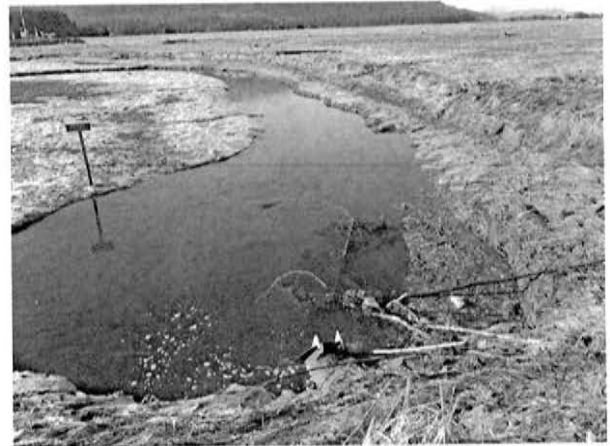
Figure 10. West berm culvert outlet at 1.8 m tide.

The pipe flap is partially rusted away and anadromous fish passage into and out of the pond is possible (Figure 11). We observed spruce tree trunks submerged at pond margins (Figure 12).