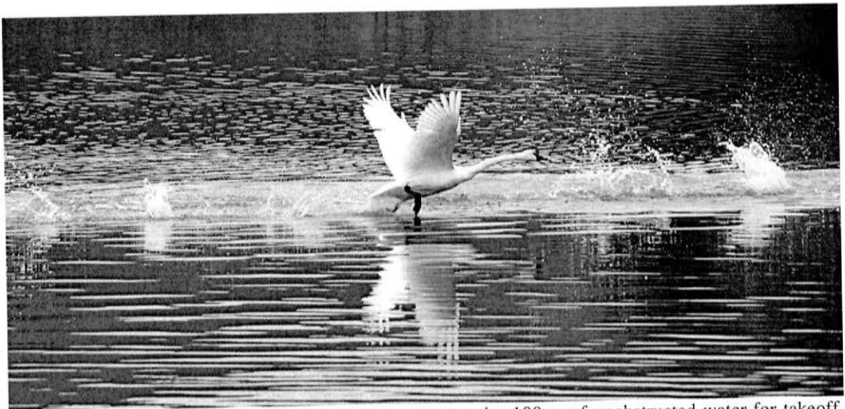
Trumpeter Swan at Honsinger Pond. Trumpeter swans require 100 m of unobstructed water for takeoff.