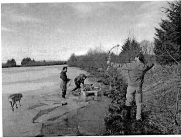
Figure 15. Johnny Zutz takes aim.

it across the thin ice (Figure 15). The monofilament kept breaking, so we tied a safety line to a biologist in a drysuit with a life preserver who walked the leadline, three buoys and an anchor across the ice (Figure 16).