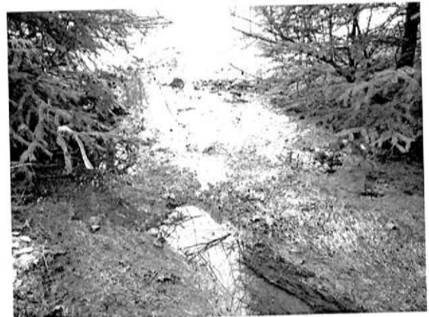
Figure 14. Rust stains from flashy drainage.