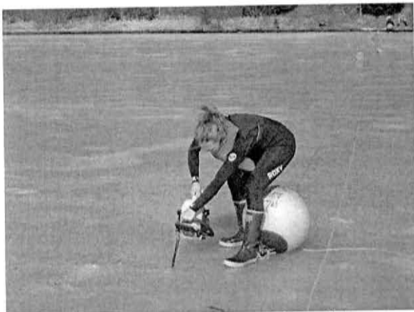
Figure 17. Tess Quinn cuts holes through ice.

We secured the 182 m leadline to trees on both sides of the pond. We used a chainsaw lubed with canola oil to cut holes through the 6 cm thick ice at about 9 m intervals (Figure 17). As the weather warmed and ice thinned, we paddled a Livingston across the pond, which was ice free by April 3 rd (Figure 18). We set minnow traps along the trapline from the west to the east bank.