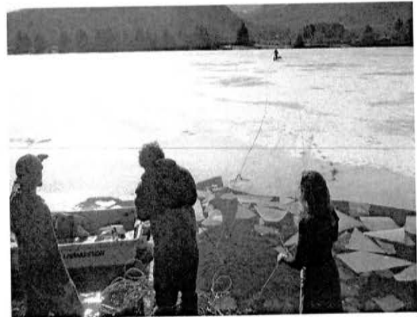
Figure 16. Jackie Timothy and Ivy dog cross ice.

We secured the 182 m leadline to trees on both sides of the pond. We used a chainsaw lubed with canola oil to cut holes through the 6 cm thick ice at about 9 m intervals (Figure 17). As the weather warmed and ice thinned, we paddled a Livingston across the pond, which was ice free by April 3 rd (Figure 18). We set minnow traps along the trapline from the west to the east bank.