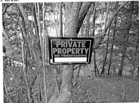
Figure 8. Private property sign near Temsco.