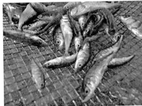
Figure 6. Threespine stickleback in pond.

The berms that surround the Honsinger Pond, and divide the property north/south on the east side, transition between sedge meadow and spruce Picea sitchensis forest. Occasional hemlock Tsuga heterophylla and cottonwood Populus balsamifera contribute to the overstory for a variety of shrubs and forbs, with alder, willow, cow parsnip, and fireweed occupying the most recently disturbed areas. Bald eagle Haliaeetus leucocephalus , raven Corvus corax , crow Corvus caurinus , and gull Larus sp. feathers demonstrate use of the area by these species. We found waterfowl feathers and droppings on the berms. We observed a river otter latrine, probable coyote Canis latrans scat, and Sitka black-tailed deer Odocoileus hemionus sitkensis bones and hair but the origin is unknown.