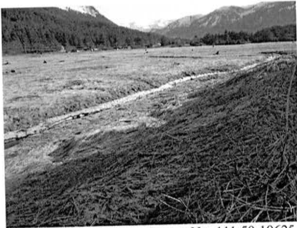
Figure 13. Anadromous Stream No. 111-50-10625.