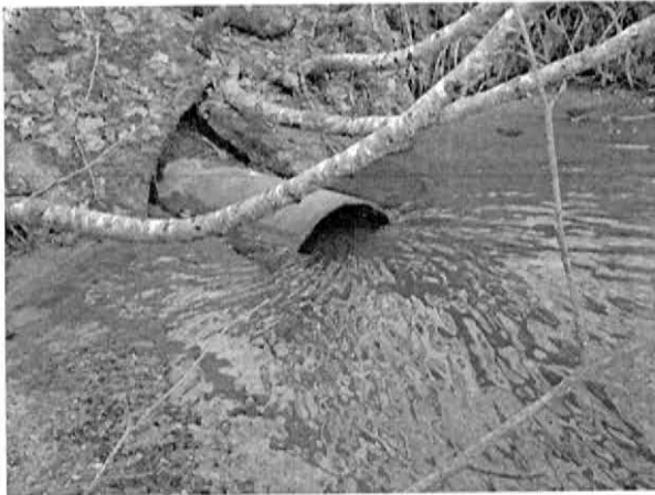
Figure 9. West berm culvert inlet at low tide.

There is an old 0.60 m pipe that pierces the west side of the berm (Figure 9); intended to let ground water from the pond move into the estuary while stopping tidewater from entering the pond during gravel extraction. The pipe is at about 4 m in elevation and a pond formed at the outlet contains water throughout the tide cycle (Figure 10).