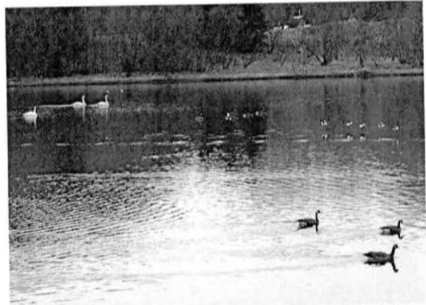
Figure 18. Honsinger Pond, ice free April 3rd, 2012.

We removed our trapline from the water on April 13 th , 2012 when we had information sufficient to document juvenile salmonid overwintering in Honsinger Pond and determine the potential for juvenile salmonid overwintering in Honsinger Pond.